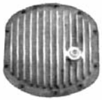
TDP-4013 Dana 30