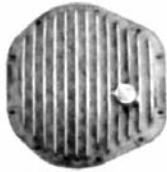
TDP-4014 Dana 44