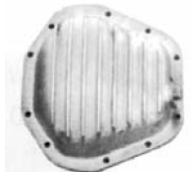
TDP-4183 Dana 60*