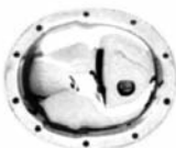
TDP-9711 Dana 35

* Some Dana 60 with full floating axles have the drain plug position higher on the stock differential cover than #7128 and #4183. Check for this condition BEFORE installing #7128 or #4183.