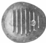
TDP-4784 GM Truck – 10-Bolt