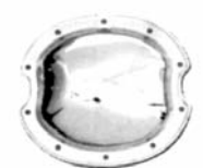
TDP-9190 GM '71-'81