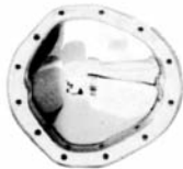
TDP-9070 GM Truck – 12-Bolt