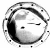
CHR-7126 GM 12-Bolt Intermediate