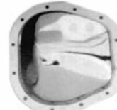
TDP-9466 Ford Truck – 12-Bolt