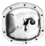
TDP-9238 Dana 30