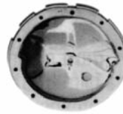
TDP-4135 '88-Up GM 1/2 Ton