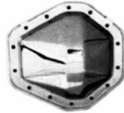
CHR-7123 GM Truck – 14-Bolt