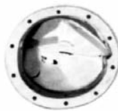
CHR-7125 GM 10-Bolt Intermediate