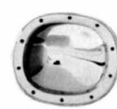
CHR-7546 Camaro, S-10 '82-Up