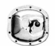
TDP-9710 Dana 30 Thick