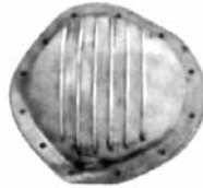
TDP-4134 GM Truck – 12-Bolt