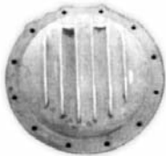
TDP-4778 Jeep Corporate