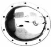
TDP-9069 GM Truck – 10-Bolt