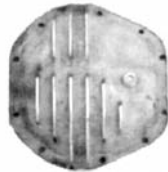
TDP-4133 Dana 44