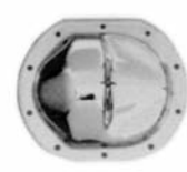
CHR-7129 Ford 7.5" R.G.