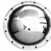
TDP-9119 Jeep Corporate