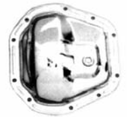
CHR-7128 Dana 60*