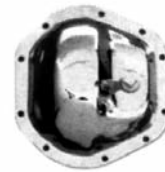
CHR-7124 Dana 44